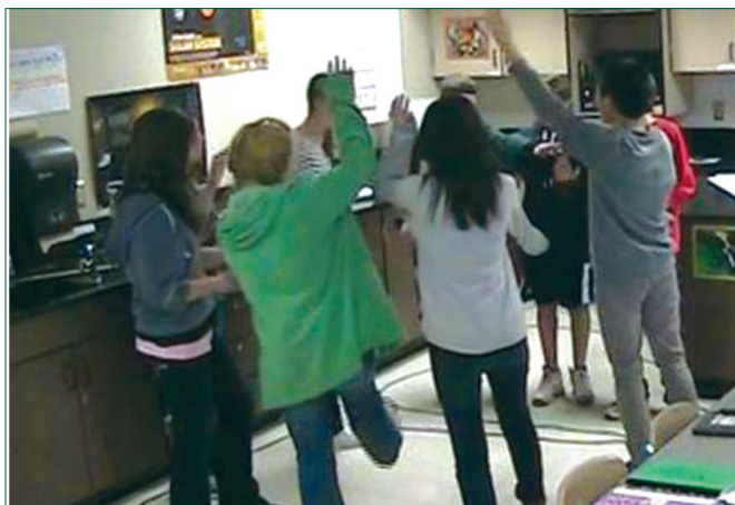
Fig. 2. Eighth-grade students participating in the Energy Theater of a ball bouncing. They stand in two loops of rope to represent energy in a ball and the ground. A “K” body shape signifies kinetic energy.

Energy Theater can be organized into three stages: Choreography, Performance, and Reflection and Assessment. In the Choreography stage, students work together to represent the energy in a scenario. In the Performance stage, different groups share their ideas by acting out their representation. Finally, students revise and reflect on their representations in the Reflection and Assessment stage.