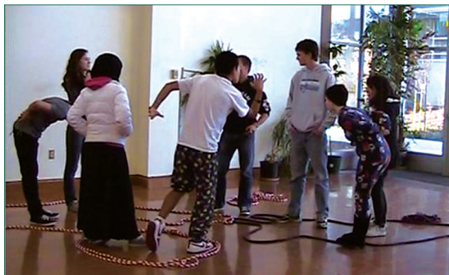
Fig. 1. In this enactment of Energy Theater, high school AP/IB Biology students represent the energy involved when a rabbit hears an apple fall to the ground. Each student is a unit of energy; loops of rope on the floor represent the rabbit, the apple, and the Sun.

These standards are supported by Energy Theater through its design and application in the classroom. Energy Theater emphasizes energy conservation (goal 1 above) by treating energy as concrete units (people) that neither appear nor disappear during any process. Changes of energy are represented by people who move into, out of, and within the system of objects in the scenario (goal 2). Each person (unit of energy) has a form associated with an observable indicator, such as a hand sign (goal 3). Finally, Energy Theater supports theorizing mechanisms for energy transfers and transformations (goal 4): since Energy Theater represents energy transfers and transformations as visible events, learners are called upon