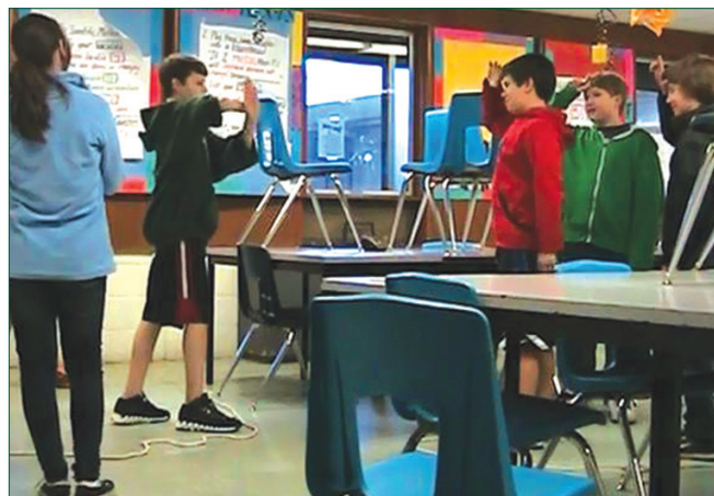
Fig. 3. Seventh-grade science students perform Energy Theater of sunlight hitting a solar bag (a large black bag of air that swells in the Sun).

In Step 1, a group of students considers the objects involved in the scenario and places ropes on the ground in large loops, one for each object. Each student standing inside a loop of rope corresponds to an energy unit contained in that object. In Step 2, they identify the forms of energy present in the scenario (e.g., chemical potential, thermal, kinetic, etc.) and pick appropriate hand signals for each form (e.g., students in Fig. 3 are using their bodies to make the shape of a “K” for kinetic energy). Students can invent forms they need based on their indicators (e.g., some students use “motion energy” instead of kinetic energy). Once Steps 1 and 2 are completed (in either order), students determine which form of energy each group member represents at the beginning of the